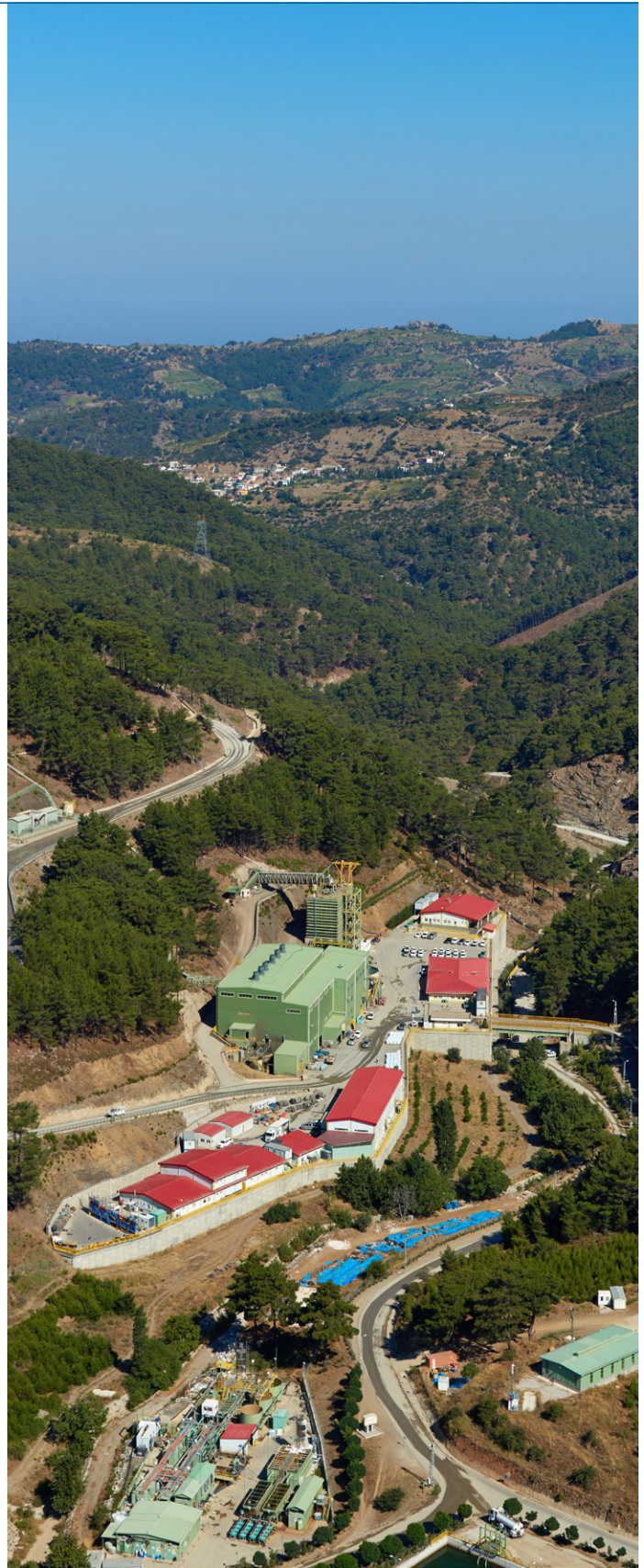
The Efemçukuru mine, Turkey.

The Report does not include Eldorado's base metal assets or exploration or development stage projects, as these operations do not produce gold or gold-bearing materials. The Olympias Mine has been included by exception, as the construction project produced a small amount of gold concentrate in 2016 as part of tailings retreatment.