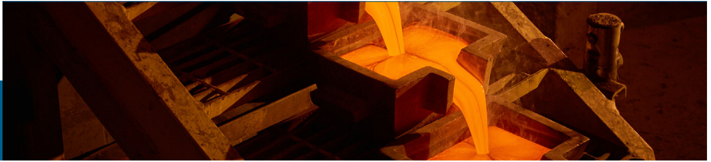
Gold pour at Kışladağ mine, Turkey.