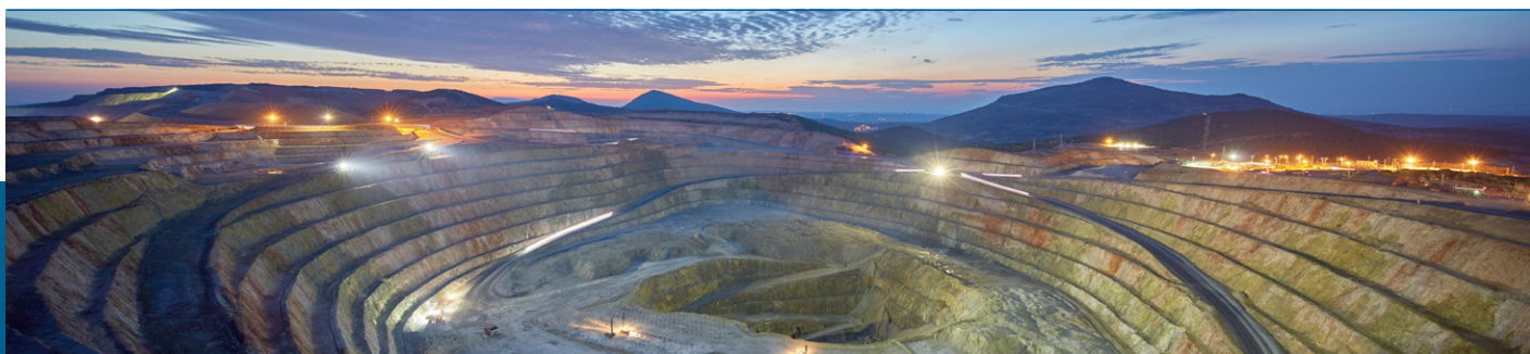
Sunset over the Kışladağ mine pit.