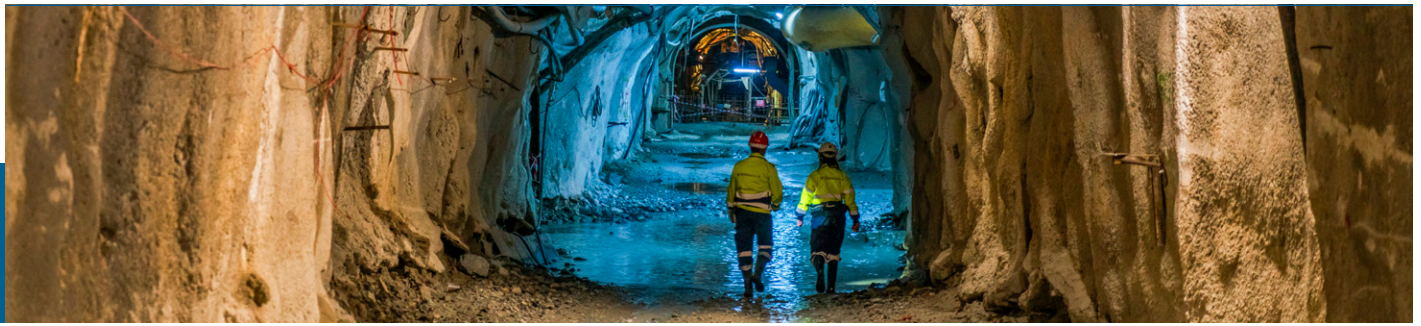
Underground at the Olympias mine, Greece.