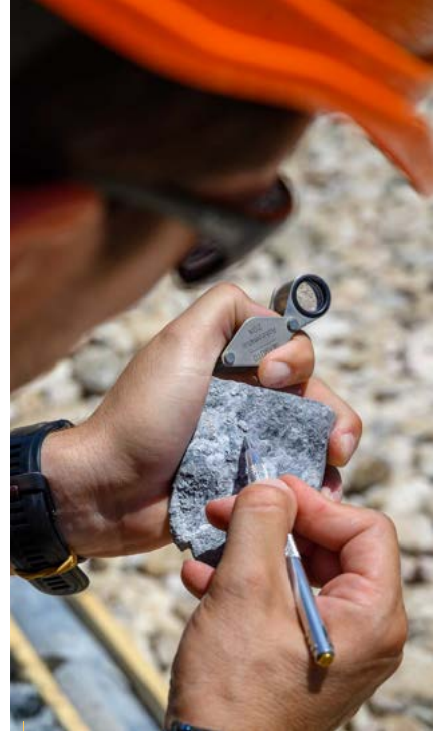
Kassandra Mines, Greece

Eldorado's non-gold producing assets, exploration or other development stage projects were excluded from the assessment as these sites do not produce gold or gold-bearing materials.