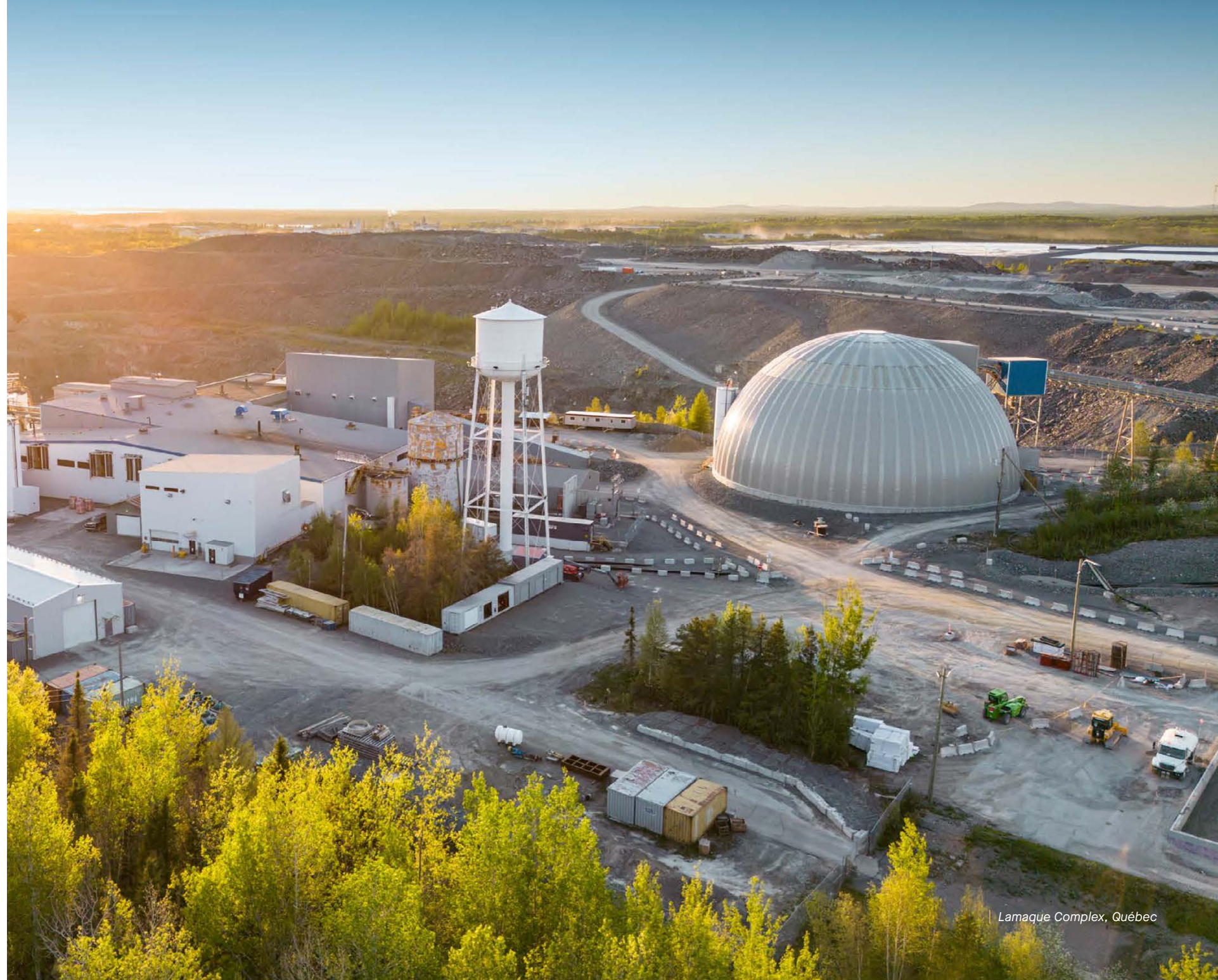
Lamaque Complex, Québec

The Report does not include Eldorado's base metal assets, exploration sites or other development stage projects as these sites did not produce gold or gold-bearing materials in 2023.